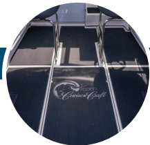
- SeaDek Flooring