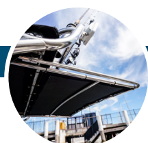
- Sliding Extension