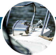
- Lewmar Electric Winch