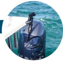
- Salt/Freshwater Deckwash