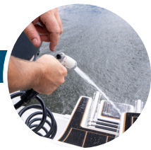
- Salt/Freshwater Deckwash