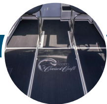
- SeaDek Flooring