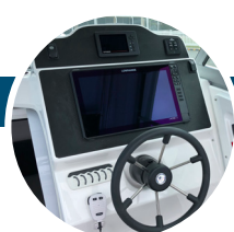
- Large Dash UPGRADE