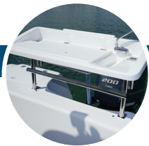
- Premium Baitboard