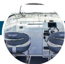
- Lockable Sliding Door