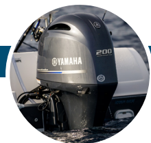
- Yamaha F200 XCA