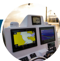
- Garmin GPSMap 8400 series