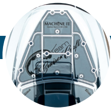
- SeaDek Flooring