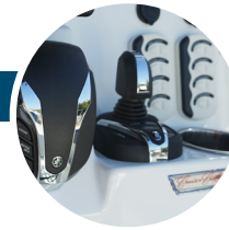
- Yamaha Helm Master EX