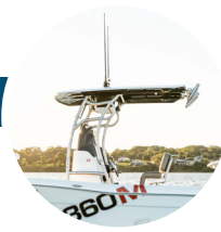
- Fibreglass Hardtop