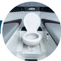
- Toilet-Electric Macerator