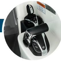
- Yamaha Helm Master EX