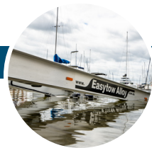
- EasyTow Alloy Trailer