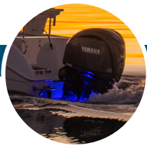
- Underwater Lights