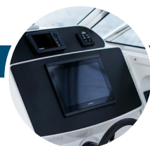
- Garmin GPSMap 8400 series