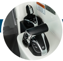
- Yamaha Helm Master EX