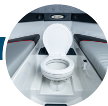
- Toilet-Electric Macerator