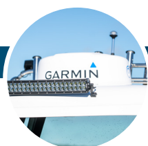
- Garmin Fantom Radar