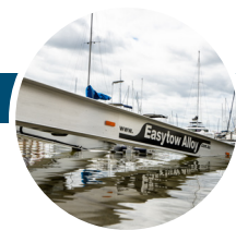
- EasyTow Alloy Trailer