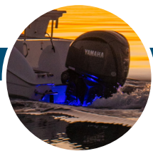
- Underwater Lights