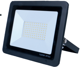
Image shown FLAC100BPC