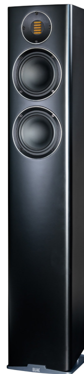
Front Carina FS 247.4