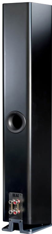
Back Carina FS 247.4