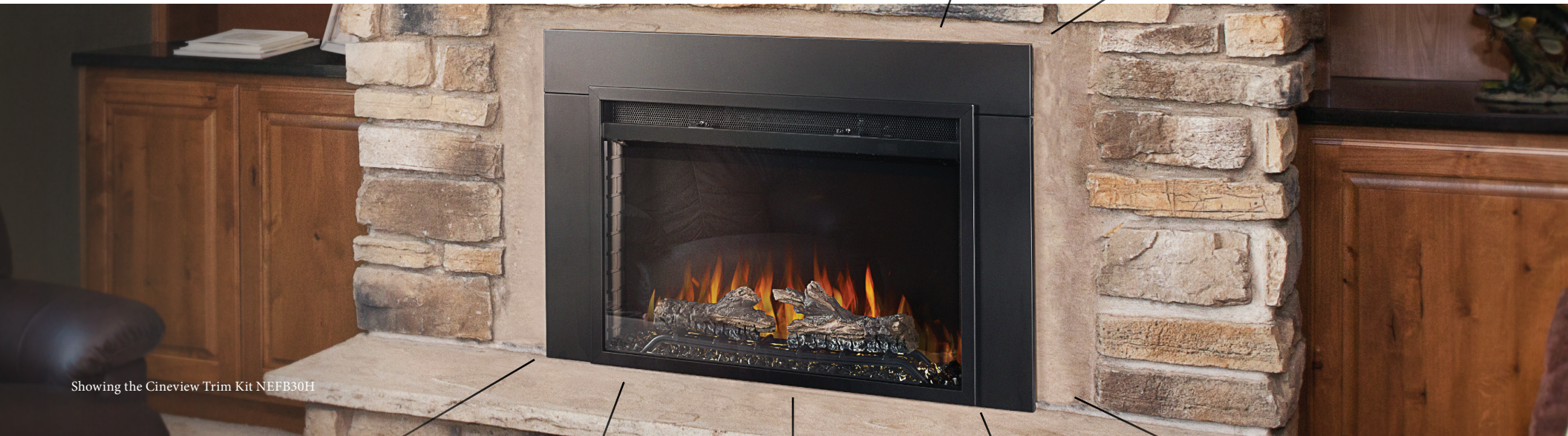
Showing the Cineview Trim Kit NEFB30H

Offer an eco-friendly replacement for drafty wood boxes