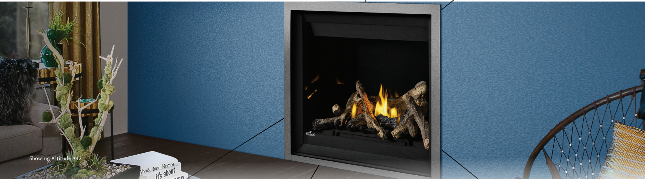
Showing Altitude A42

Fulfills consumer demand with the full view design