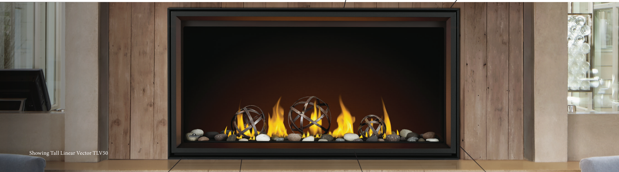
Showing Tall Linear Vector TLV50

Features a stunning frameless design with the included 5/16" flange