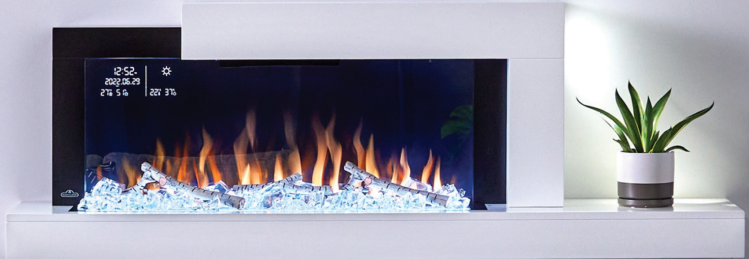
Showing Stylus Cara Elite

This upgraded fireplace offers the same benefits as the original model you love, with new innovative features