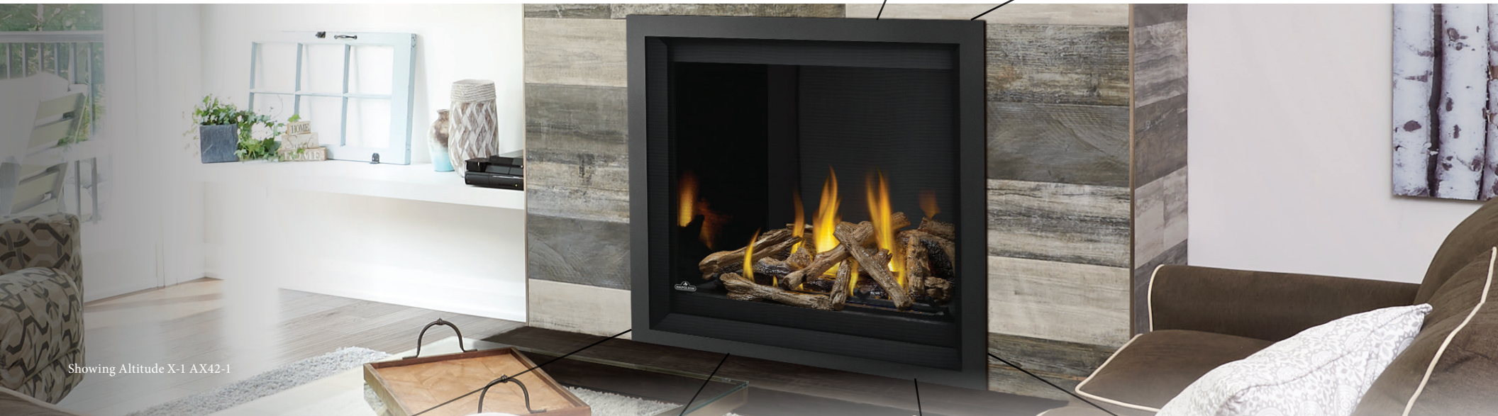
Showing Altitude X-1 AX42-1

Designed with an expansive full view to meet consumer demand