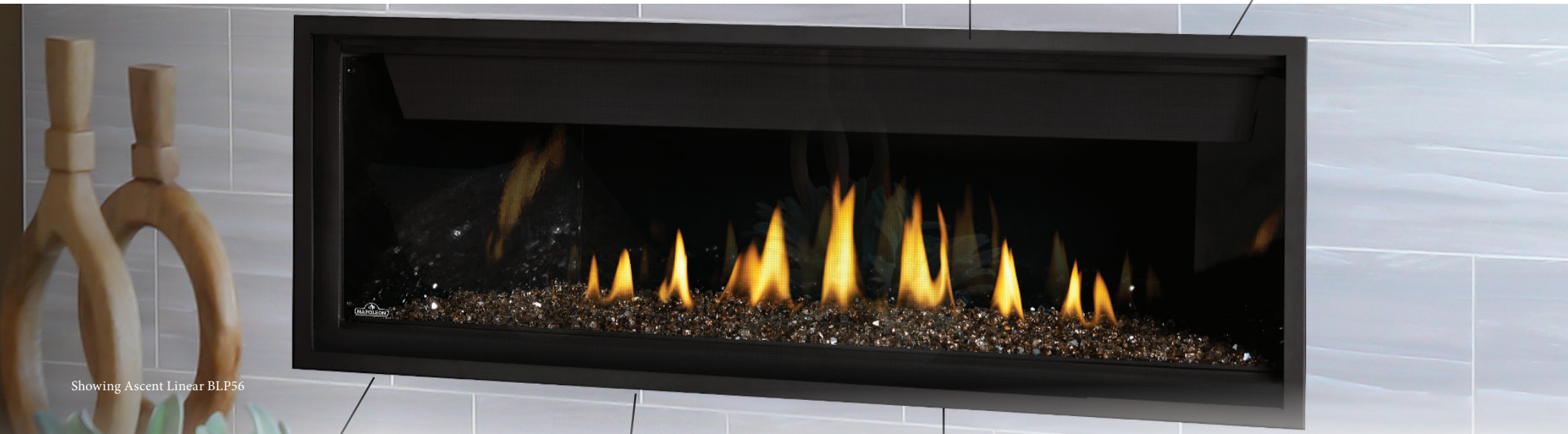
Showing Ascent Linear BLP56

Featuring a refined design and premium construction, offering more amenities at an affordable price