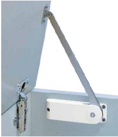
Illustration Shows Right Hand