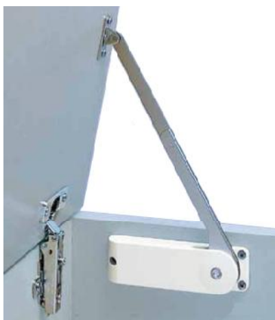
Illustration Shows Right Hand