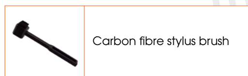
Carbon fibre stylus brush