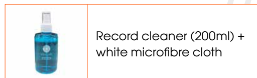
Record cleaner (200ml) + white microfibre cloth