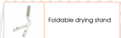
Foldable drying stand