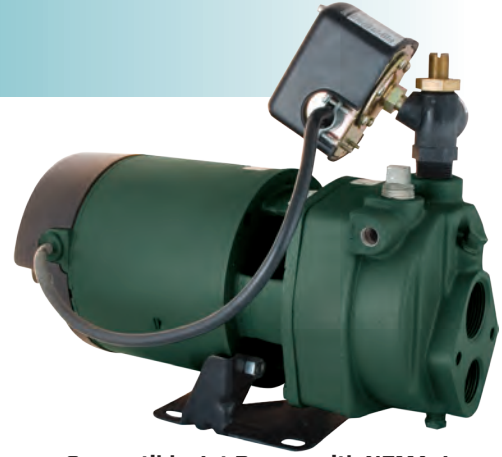
Convertible Jet Pumps with NEMA J adaptable uni-frame motor

NE462 - 1/2 HP 115/230 V 1-1/4" inlet, 3/4" discharge