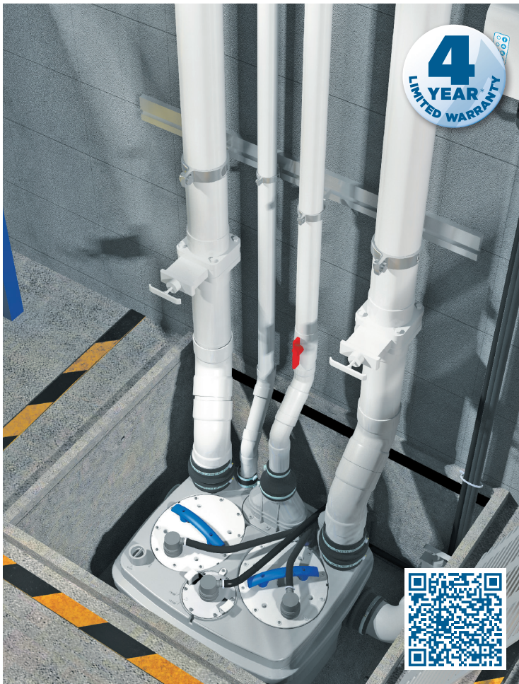
Installation below the ground