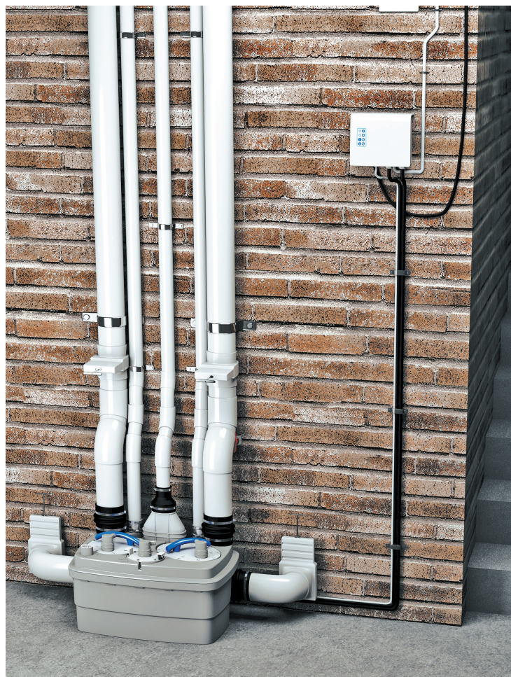
Installation above ground