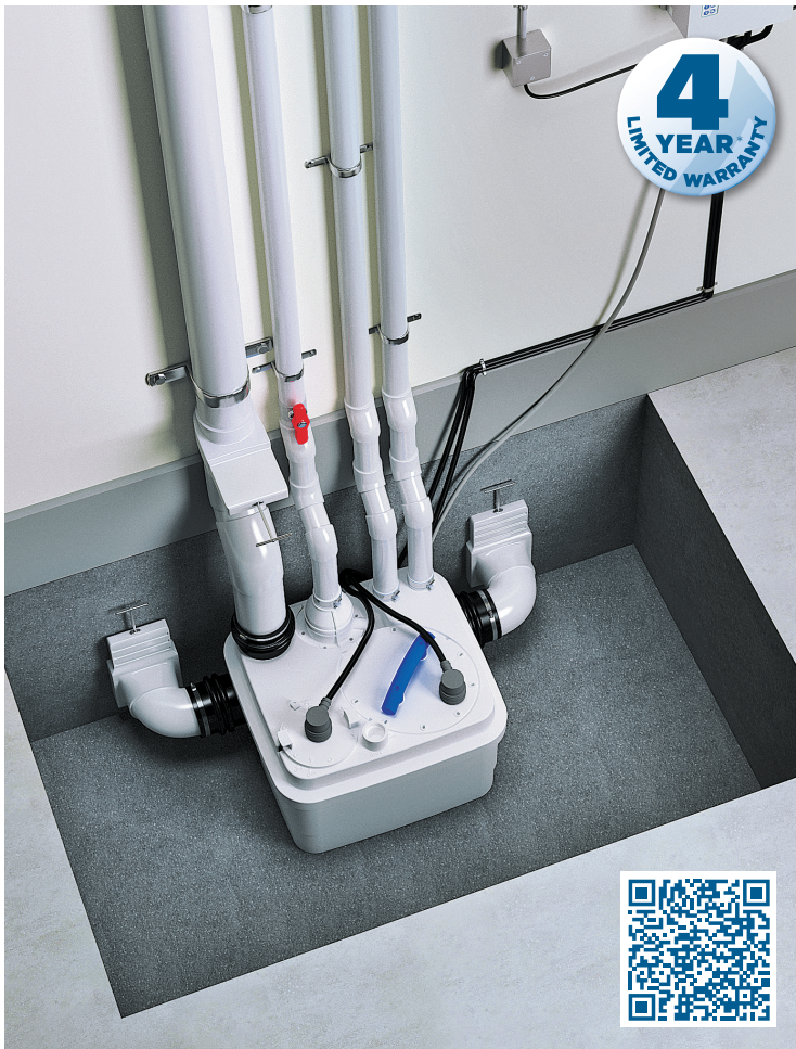
Installation below the ground