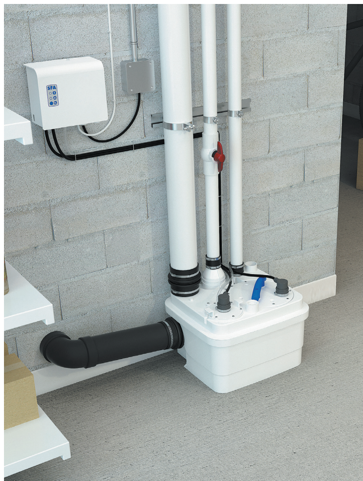
Installation above ground