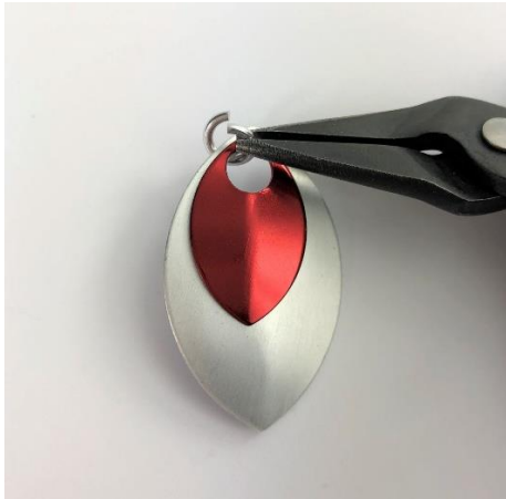
Step 1 – Connect both scales

Step 1: Using one of the small rings, connect one small and one large scale. Make sure both scales are lying flat against each other (both curved sides up).