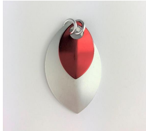
Step 2 – Two parallel rings

Step 2: Connect a second ring next to the first.