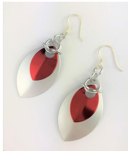
Step 9 – A pair of beauties!

Step 9: Repeat steps 1–8 for your second earring