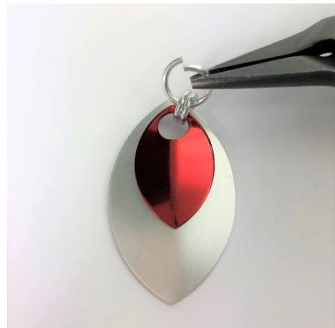
Step 3 – Through the rings only!

Step 4: Connect a second ring next to the first.