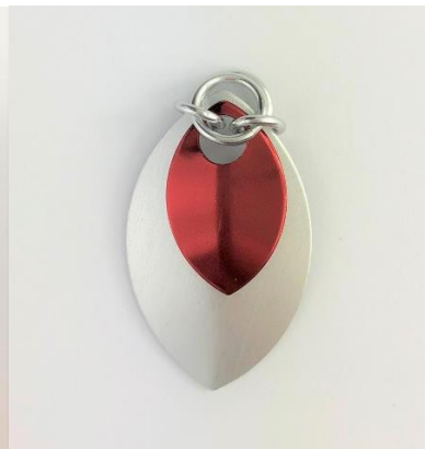
Step 6 – Push small rings apart / wiggle, wiggle, wiggle / End position

Step 7: Take one small ring and connect it to the top of the two large rings, as shown.