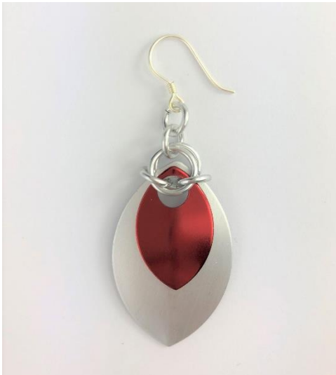
Step 8 – One beautiful earring

Step 8: Use the last small ring to attach your earring hook.