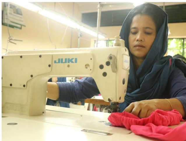
Mothers being trained in agriculture and tailoring