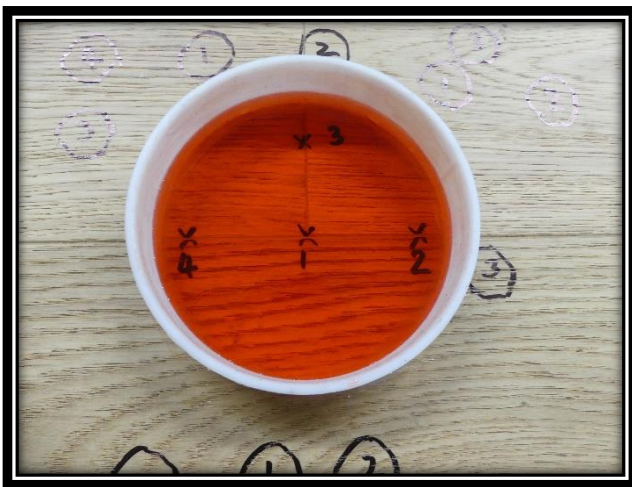
24hrs with water Wet Swell