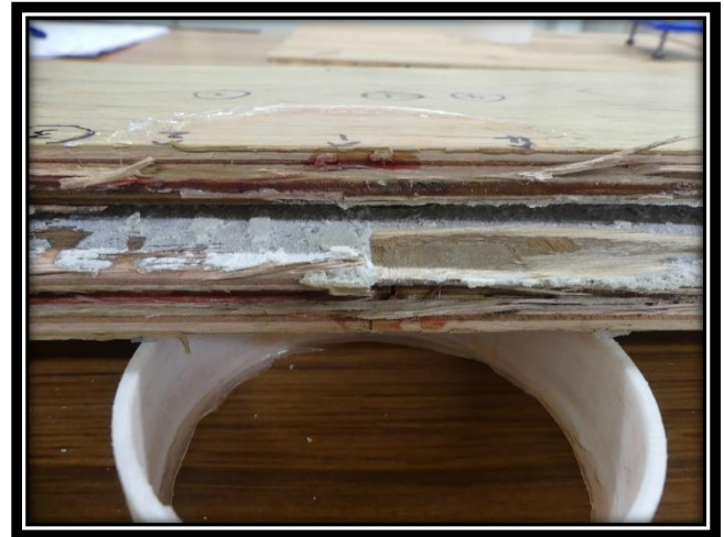
Disassembled after recovery

“THIS REPORT APPLIES ONLY TO THE SAMPLES TESTED”