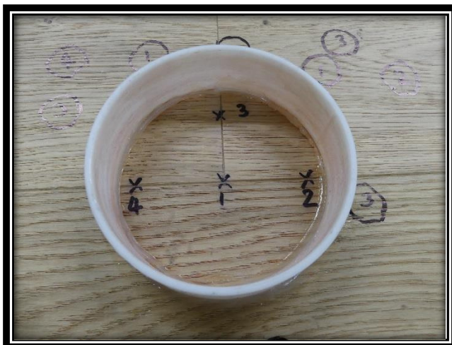
Wet Swell after recovery