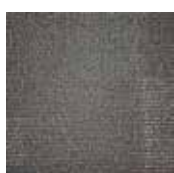
GREAT BARRIER 05