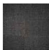
GREAT BARRIER 07