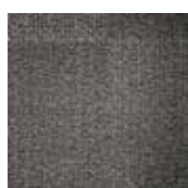
GREAT BARRIER 06