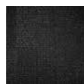
GREAT BARRIER 15