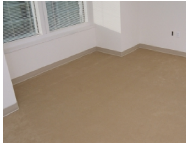
Prevent traffic over carpeted area for a minimum of 24 to 48 hours after installation

roller weight. Eliminate any bubbles by pressing straight down prior to full adhesive set up time. Do not roll bubbles to edge. Woven carpet should be rolled a second time about 3 to 12 hours after initial rolling to make sure a strong bond is established. Due to dimensional instability, double-glue installation of carpet with a unitary backing is typically not recommended. Prevent all traffic over carpeted area for a mini-