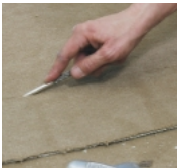
Use seaming technique appropriate for carpet type

Confirm amount and placement of adhesive by installing a small area, then lifting the carpet, noting adhesive transfer and coverage into backstitch of carpet. If insufficient coverage is seen, increase notch size and recheck.