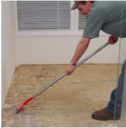
Start with a clean, dry, and smooth floor

The floor should be free of holes and loose tiles or boards. Repairs should be made as necessary to provide a smooth surface for carpet and cushion installation. The floor should be dry and dust-free. All contaminants that may prevent good adhesion need to be removed. Floors should be vacuumed, mopped if necessary, and otherwise thoroughly cleaned prior to carpet installation. Excessive use of water for cleaning is not recommended, though mopping with a slightly damp mop is useful to remove dust from the floor surface. Architectural tack strip, properly spaced and secured, may be used to hold the carpet edges in place. Setting cove base on top of carpet will also secure edges.