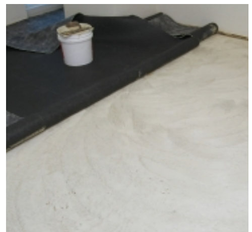
Proper open time is critical for a successful installation