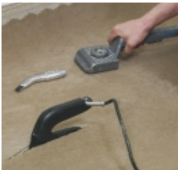
Typical tools for carpet seaming