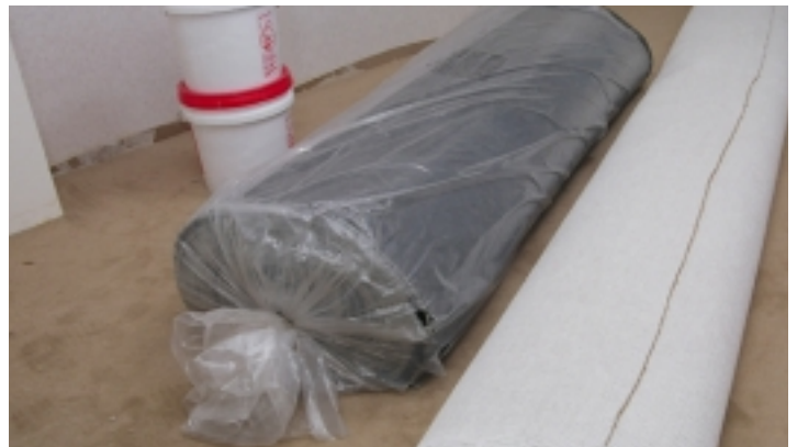
Acclimate materials for 48 hours prior to installation

The space in which the carpet is to be installed needs to have adequate temperature and humidity control to facilitate proper installation. Beginning 48 hours before the installation and continuing at least 72 hours following completion of the installation, the temperature needs to be maintained between 65° F. and 95° F. and the relative humidity between 10% and 65%. To achieve the best possible installation, according to The Carpet & Rug Institute's CRI 104 (2002), all materials should be acclimated 48 hours prior to installation. If installing over concrete, the slab temperature should not be less than 65° F. The completed installation needs to be maintained at a minimum of 55° F at all times.