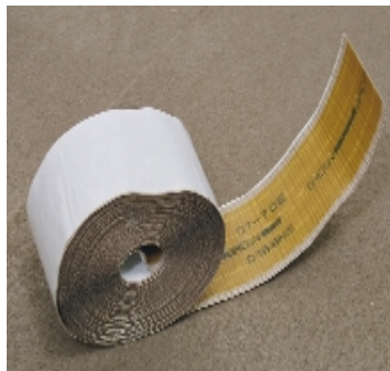
Use only hot melt seaming tape designed for double-glue installation