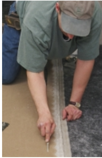
Dry-fit carpet according to layout plan

should be laid into the adhesive while in a "tacky wet" condition. For pressure sensitive adhesives, this point is often identified when the adhesive turns clear from its original opaque appearance. Smooth the cushion into the adhesive, working toward the seams. Trim in, eliminating any bubbles or wrinkles so the seams are tight without overlapping.