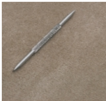
Finished seam (below tool) is nearly invisible