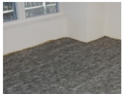
Cushion installation complete