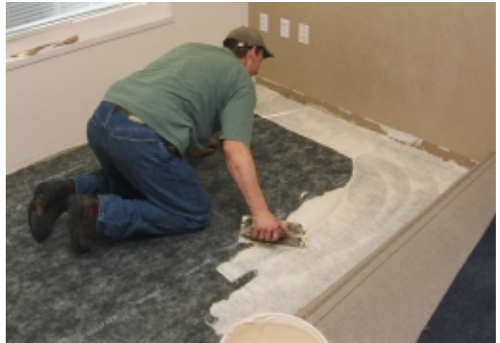
Apply adhesive to cushion following manufacturer's recommendations

Care must be taken to avoid cutting into the cushion under the seam.