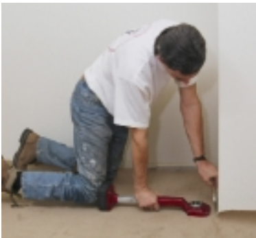
Install carpet and trim in

Once the adhesive has been spread for a given section, lay carpet into the adhesive according to the adhesive manufacturer's recommendation for open time so as to allow even distribution and penetration of adhesive on all areas of backing.