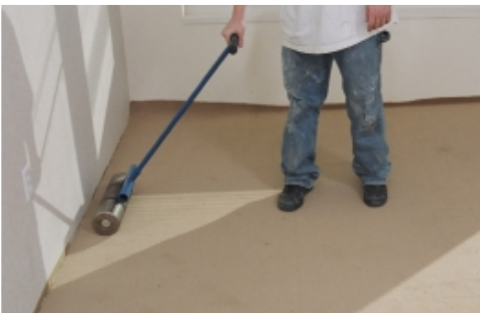
Roll in both directions to promote complete adhesion

Installation with a pressure sensitive spray adhesive system is an acceptable method for gluing cushion to floor. To be successful, this method should be performed by a Spray Certified Installation Technician. A firm cushion that is designed for double-glue installation is