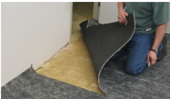
Cushion seams should have no compression or gaps