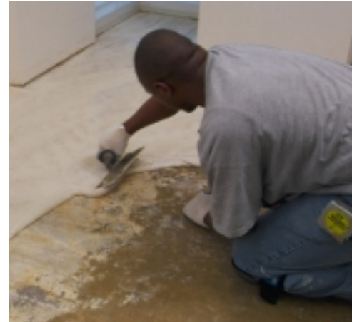
Apply adhesive to floor following manufacturer's recommendations

with a paint roller can result in an inconsistent application. Consult the adhesive manufacturer for the best application technique. For bonding, the cushion