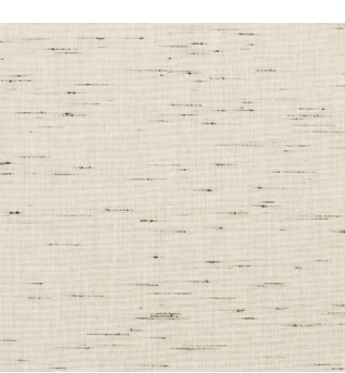
SB Fabric: Sunbrella Crest Birch