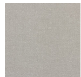
Fabric: Sunbrella Cadet Grey