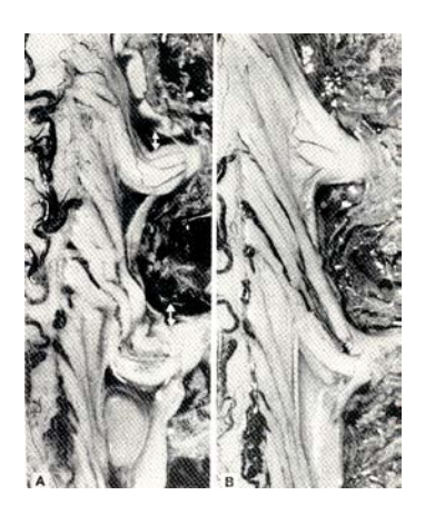
The spinal cord in neutral and flexion Breig, "Adverse Mechanical Tension in the CNS"