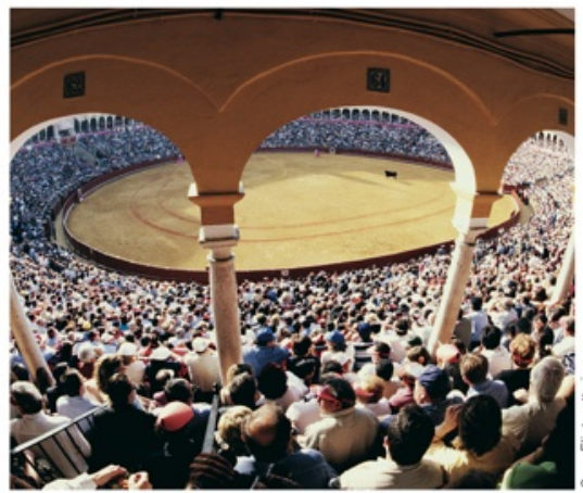
Plaza Maestanza Seville

Beautiful, glamorous and morally suspect or even bankrupt - Bullfighting is a contentious issue. Aficionados cite tradition as justification for a practice that stretches back into antiquity. Bull fighting is considered by many to be an intrinsic, even noble part of Mediterranean culture. Its origins are believed to lie in ancient fertility rites. In 1567, Pope Pius V decreed it 'contrary to Christian duty and piety'. The penalty for violating this decree, which has never been repealed, is excommunication.