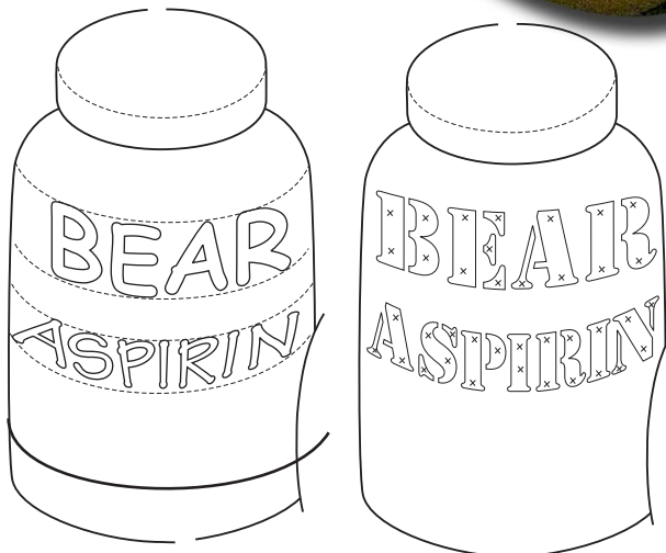
Pattern for wood burning. Pattern for scroll sawing. You can use a wood burner to add the words to the bottle, or cut out the letters with a scroll saw.

The following are recommendations that I would use for this project. Feel free to try different mixes of colors, wood and grains. These patterns are designed with 3/4" thickness of wood in mind (unless other-wise noted). However, any thickness will work. You will need 3/8" dowels for the eyes