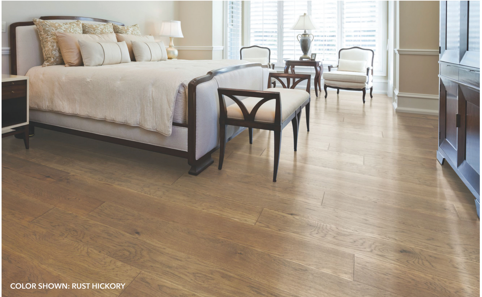
COLOR SHOWN: RUST HICKORY