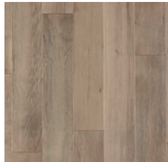
HEIRLOOM HICKORY WEK06-66