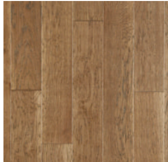
RUST HICKORY WEK06-65