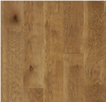
CANYON DUST HICKORY WEK06-64