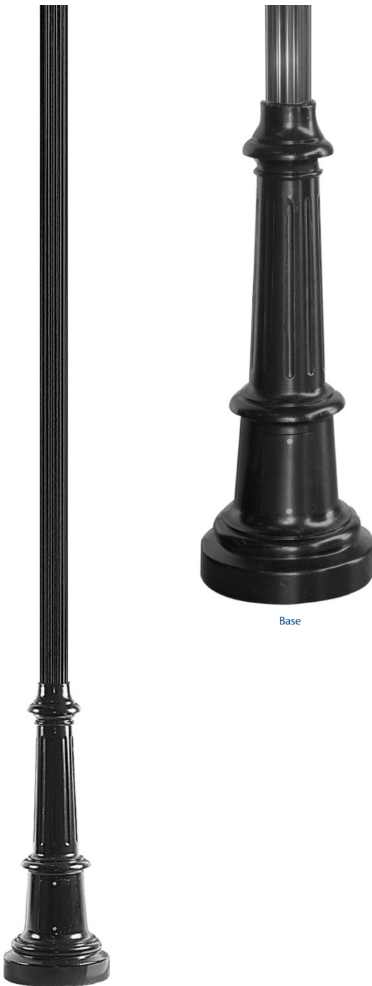
Pole & Base