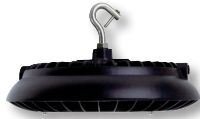
LED Round High Bay