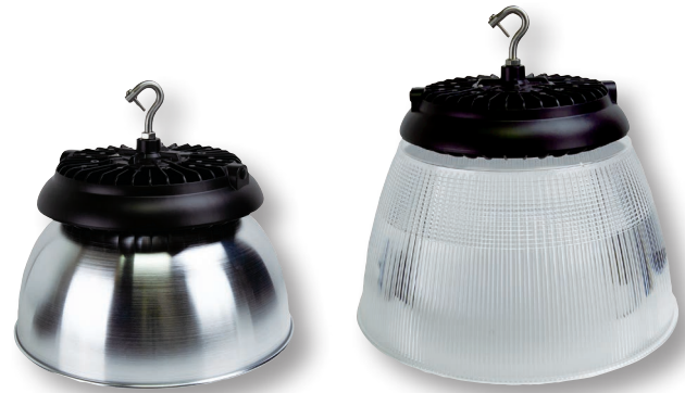
LED Round High Bay with aluminum reflector