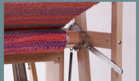
Convenient, smooth warp tension and advancement control while seated, with foot operated friction rear brake and front steel ratchet.