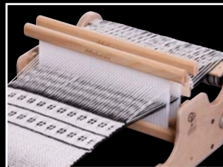
Built-in second heddle kit

Accessories: extra reeds 2.5, 5, 7.5, 10, 12.5, 15dpi, vari dent reed, loom stand.