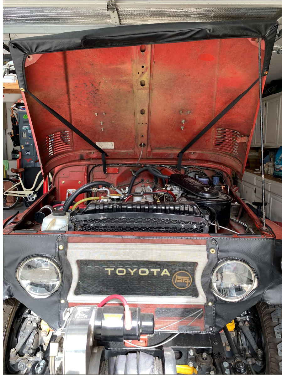
City Racer LLC