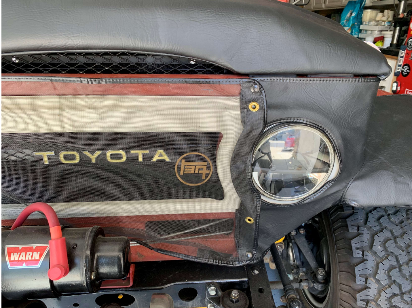
City Racer LLC