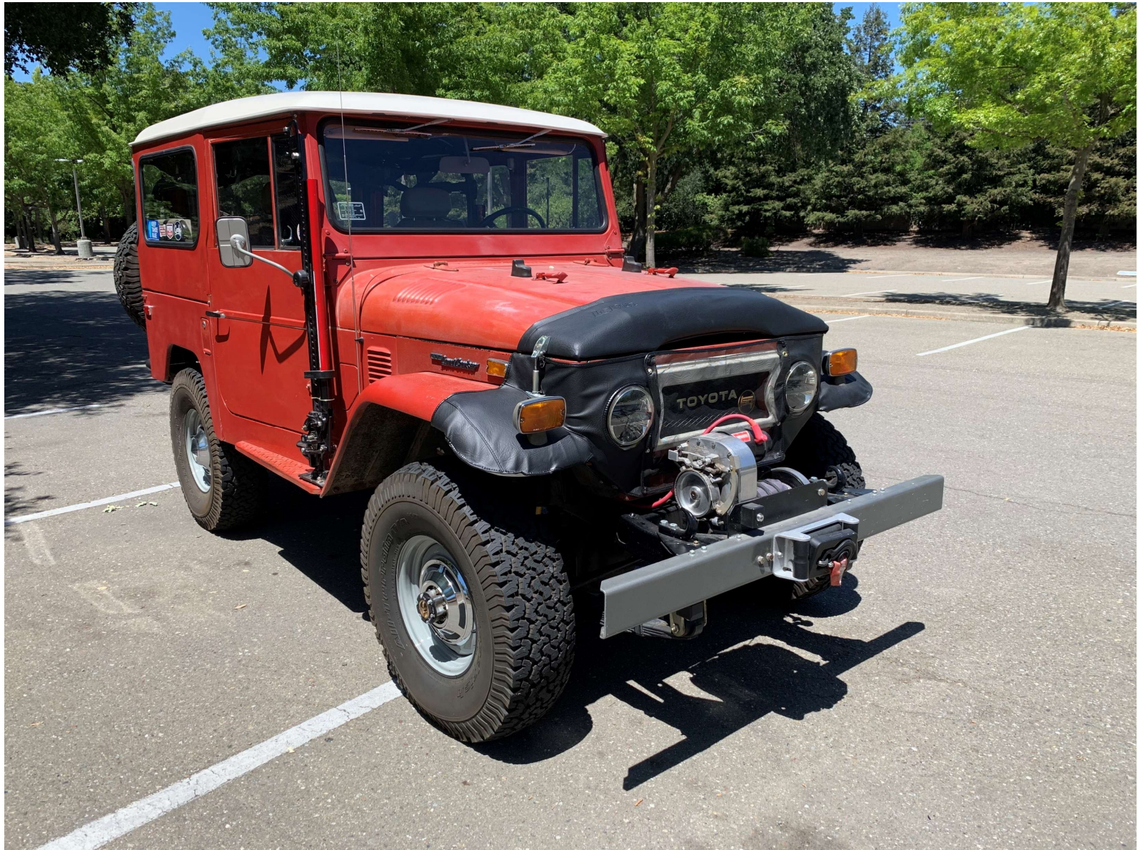
City Racer LLC