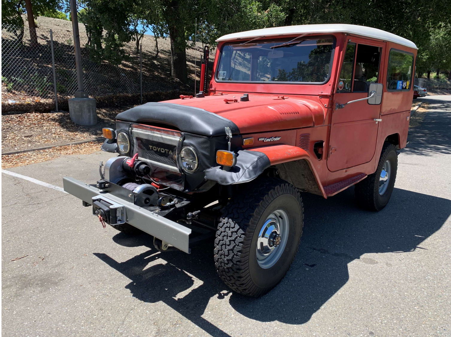
City Racer LLC