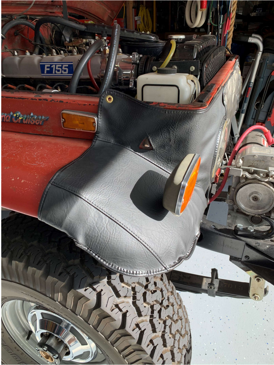
City Racer LLC