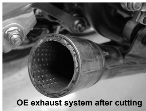
OE exhaust system after cutting

FOR HIGH PIPE INSTALLATION ONLY: Remove the passenger footpeg brackets (left and right) and replace the right side bracket with the provided high mount hanger bracket. Use the 8mm x 45mm bolts, washers and nuts to secure it. Be sure to apply threadlock to the bolts before installation.