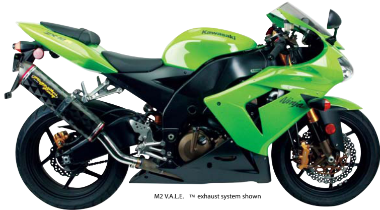
M2 V.A.L.E.™ exhaust system shown