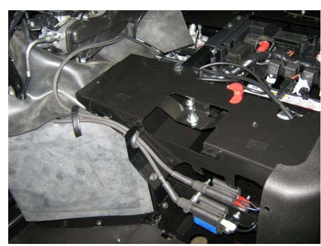
Step 7: Wire routing. (Front Cylinder)