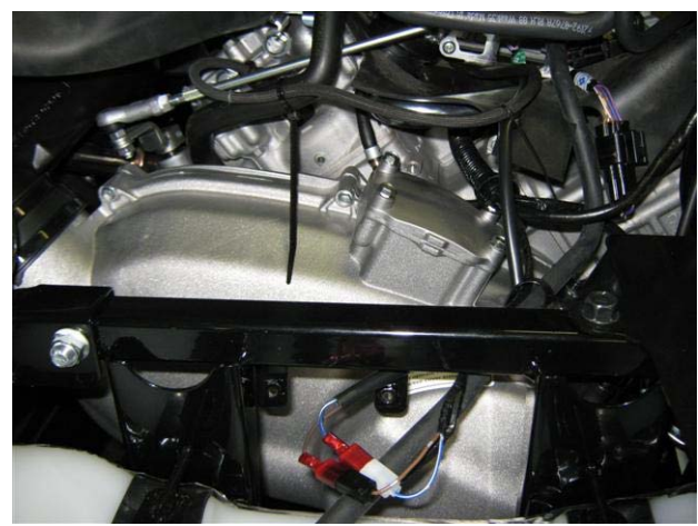
Step 7, 8: Wire routing. (Rear Cylinder)