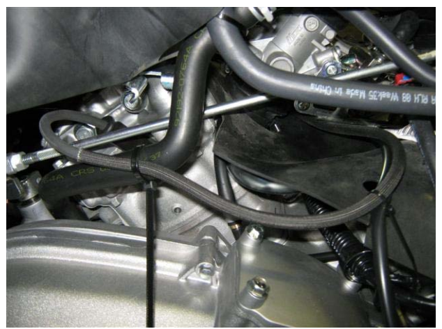
Step 8: Wire routing. (Rear Cylinder)