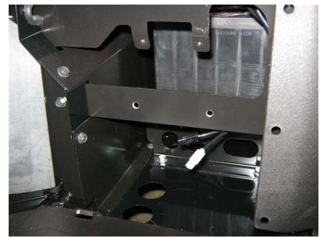
Step 4: Drill 2 holes. (0.25 inch dia.)