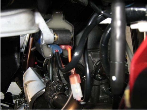
Step 3: Attach coil primary wires.