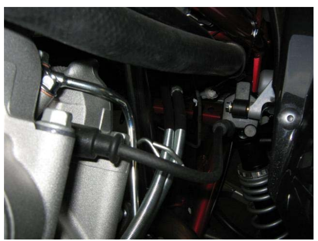
Step 2: Screw original spark plug cap onto wire. Press secondary wire onto coil and spark plug.