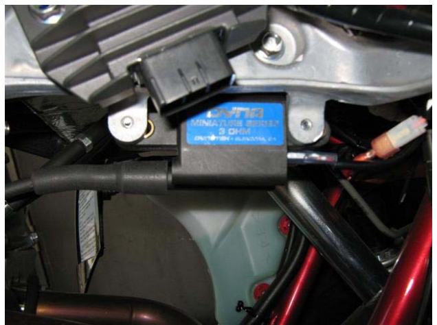
Step 1: Mount coil in original location.