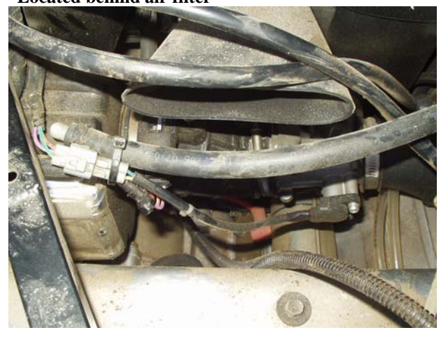
Picture 2: Throttle Position Sensor connector Located behind air filter