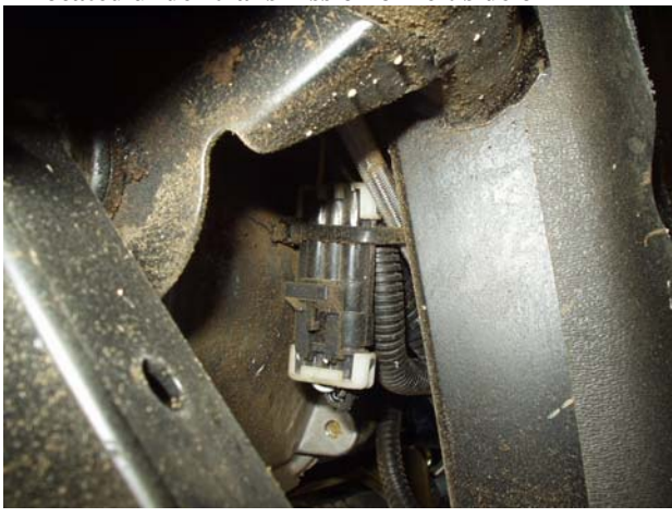
Picture 1: Crankshaft Position Sensor connector Located under transmission on left side of RzR