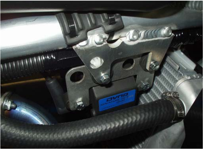
Dyna 3 Ohm coil mounted to frame.