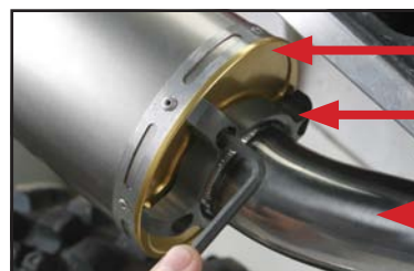
V.A.L.E.™ Assembly Detail