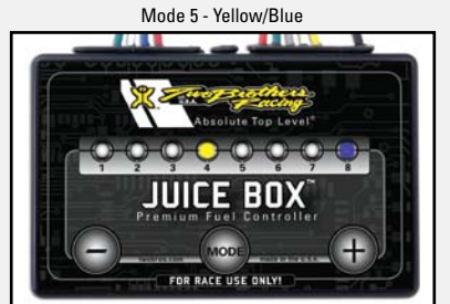
FOR RACE USE ONLY