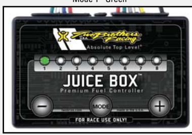
Mode 1 - Green

(2009) Kawasaki Teryx 750 Pre-set Settings: Teryx baseline settings with stock air filter and TBR DUAL exhaust system. (G=0.5, Y=3, R=3, GB=0.5, YB=4, RB=4)