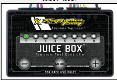
Mode 1 - Green

(2008) Can-Am Spyder Pre-set Settings: Spyder baseline settings with stock air filter and TBR Single and DUAL slip-on exhaust system. (G=0.5, Y=2, R=1, GB=6.5, YB=4, RB=4)