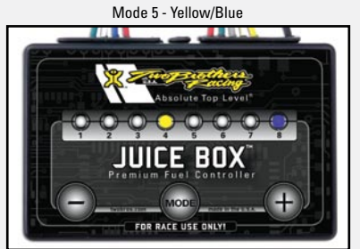
FOR RACE USE ONLY