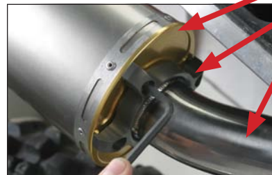
V.A.L.E.™ Assembly Detail