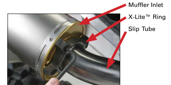
V.A.L.E.™ Assembly Detail

6. Loosely attach the V.A.L.E.™ muffler to the stainless steel V.A.L.E.™ connector tube using the supplied 6x14mm socket head cap screws and 6mm split washers.