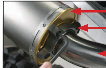
V.A.L.E.™ Assembly Detail