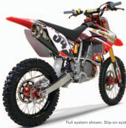
Full system shown. Slip-on system does not include header.

V.A.L.E.™ Slip-On Exhaust System with M-7 Canister Part # 005-1720406V / 005-1720407V