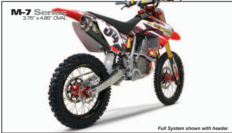
Full System shown with header.

Slip-On V.A.L.E.™ Exhaust System with M-7 Canister Part # 005-1720406V / 005-1720407V