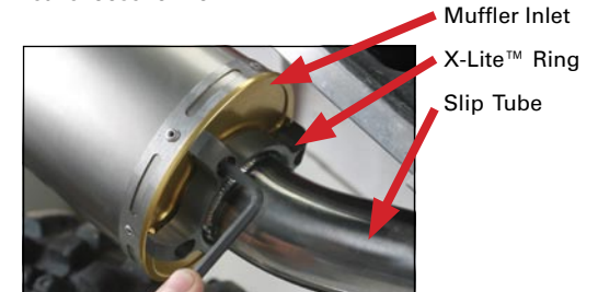
V.A.L.E.™ Assembly Detail