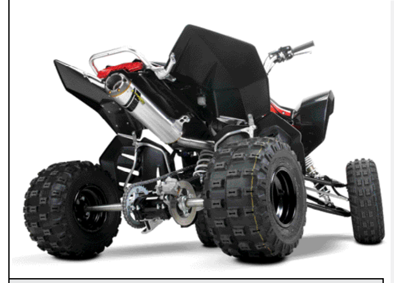
For Race Use Only

Additional Tested Setting: LTR-450 with stock airbox, TBR Slip-on exhaust with NO spark arrestor. (G=1, Y=3.5, R=3, GB=1, YB=4, RB=4)