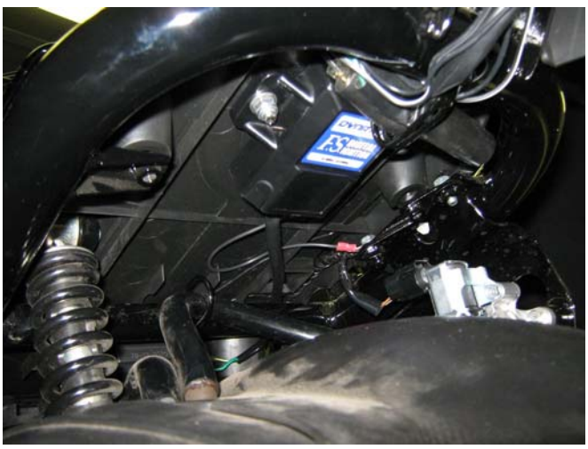
Final Ignition Mounting is under the rear deck.

The Dynatek Ignition is simple to troubleshoot. If the engine will not start, check all electrical connections. Pay close attention to the T-tap splice connectors for pickup and power. The DFS black/white wire should have +12V with ignition key on an Run Switch on. If the ignition is suspect, remove the orange coil wire and reconnect the factory Black/Yellow coil wires together. If the engine runs after changing the coil output to stock configuration, then the ignition should be returned to Dynatek for further testing.