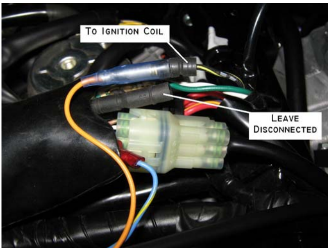
3) Ignition output connection