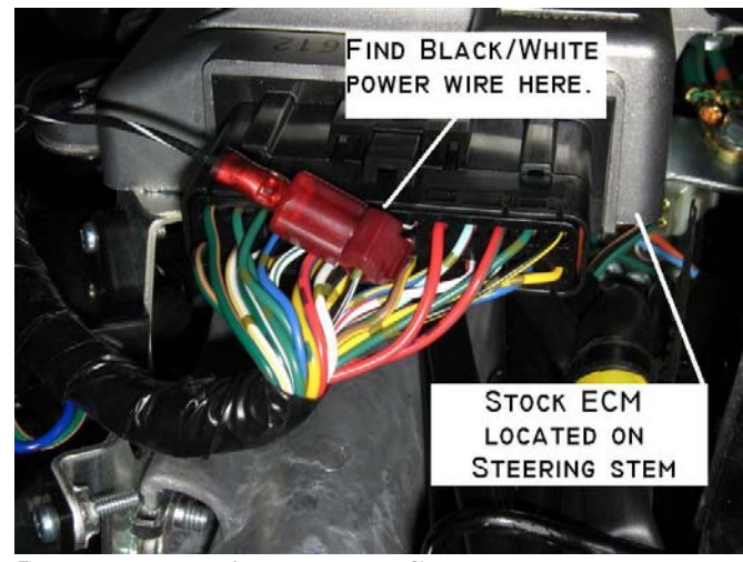
5) Power connection at stock ECM module