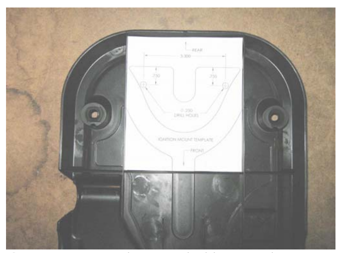
6) Use template to drill the two ignition mounting holes