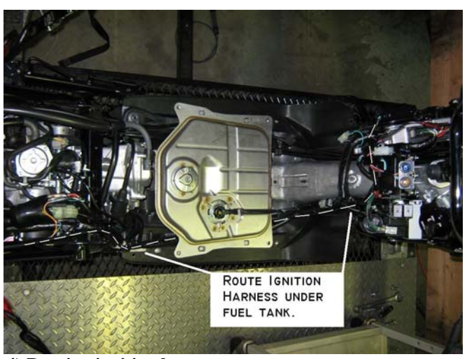
4) Routing ignition harness