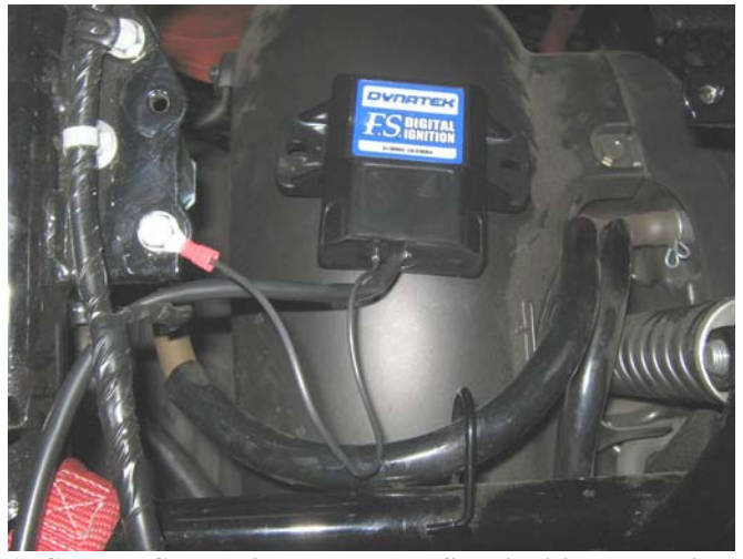
1) Ground Connection – note: not final ignition mounting 2) Pickup connection