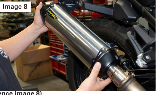
. Install muffler onto pre-installed slip-tube. (Reference image 8)

10. Install Muffler clamp using supplied 8x16mm bolt, washer and 8mm Flange nut (clamp will go between the washer and bracket). (Reference image 9)