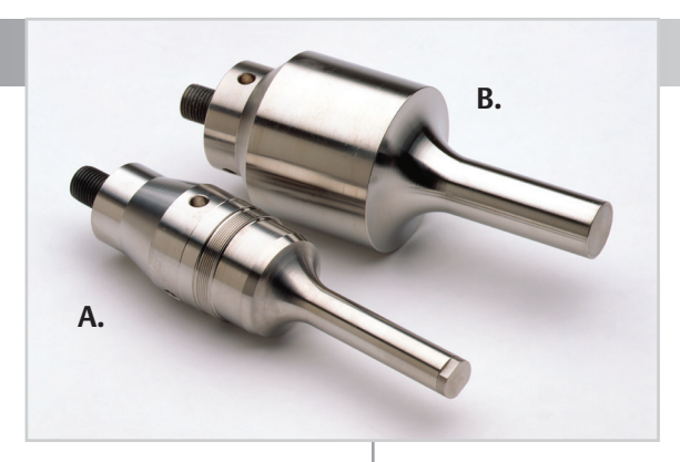
A. <sup>1</sup>/<sub>2</sub>" Horn B. <sup>3</sup>/<sub>4</sub>" Horn