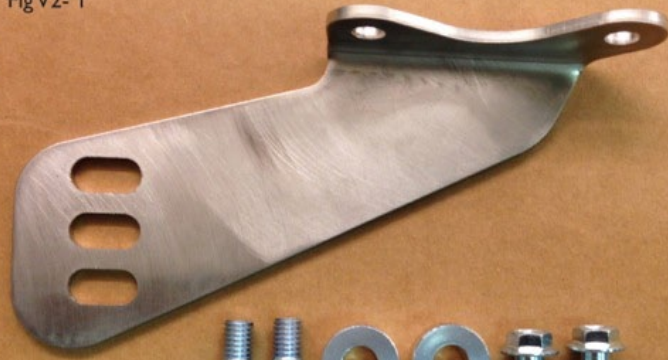
Fig V2- 1