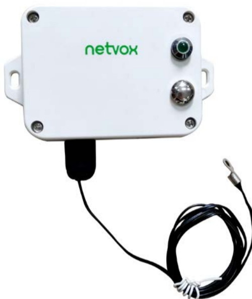
Fig.1 R718E Appearance