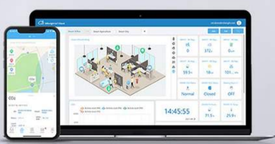
Milesight IoT Cloud